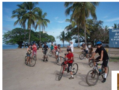
Above: A bike trip from La Paz to Playa Grande!