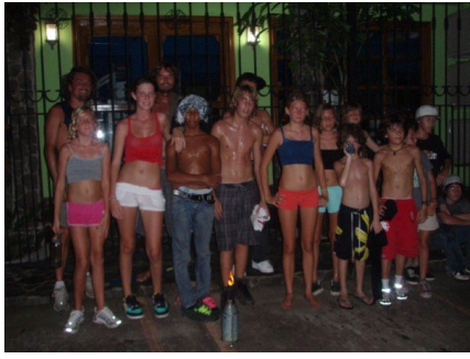
Above: The runners proudly catch their breath when they arrive at La Paz.