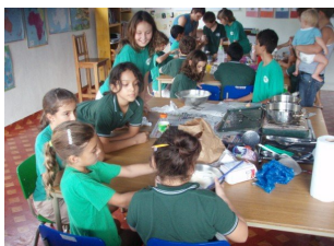
Left: Students make Israeli food with the Korens.