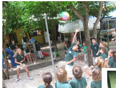
Left: Recess tetherball draws a crowd.