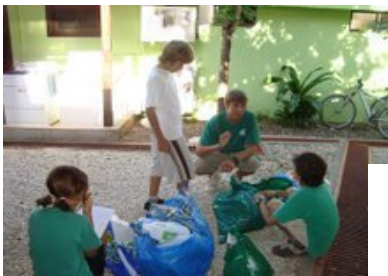
Left: Students measure and weigh the recycling.